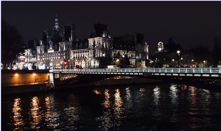
← Paris →